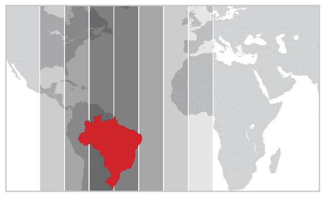
Convenient accessibility to the world